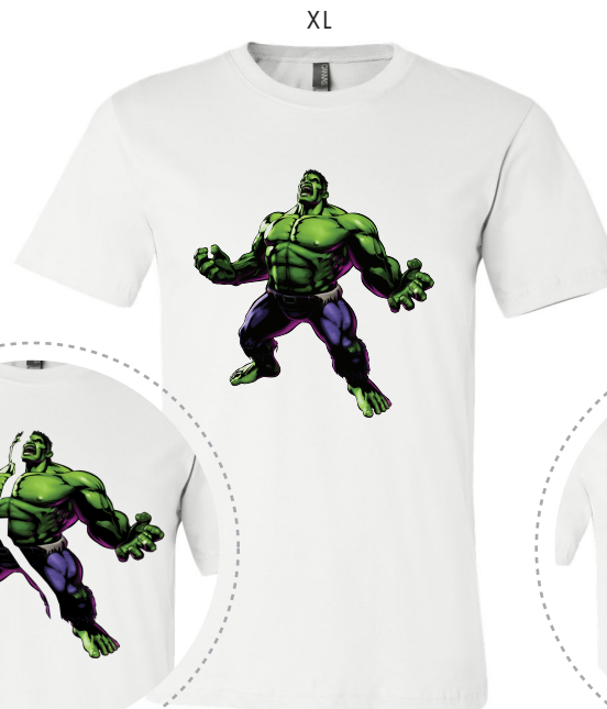
2X A4XL/LETTER PLUS